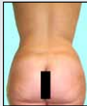
After (One month post-op)