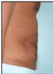
After (One month post-op)